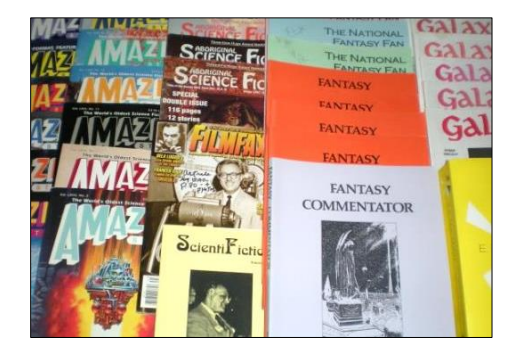
Amazing Stories, Fantasy Commentator, Filmfax, Galaxy, National Fantasy Fan

<u>SF Gateway Omnibus</u> – four novels by E.E. "Doc" Smith (issued in 2013).